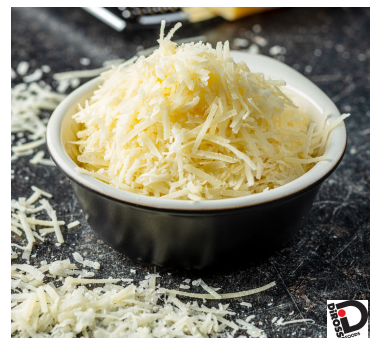
Shredded Tasty Cheese 2KG