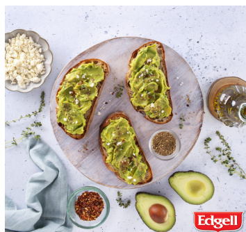
Chunky Avocado 454GM