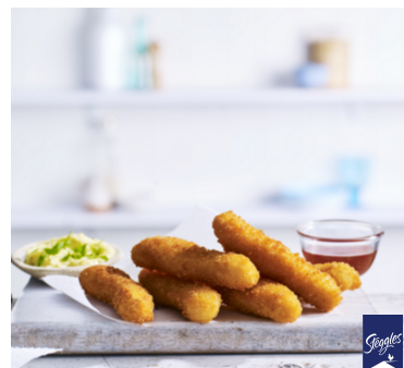
Chicken Goujons 1KG