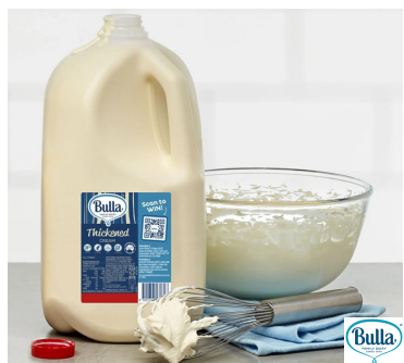
Thickened Cream 5L