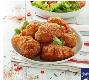
Chicken Devil Wing Dings 1KG