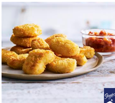
Premium Chicken Nuggets 1KG