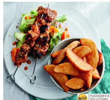
Seasoned Wedges 2KG