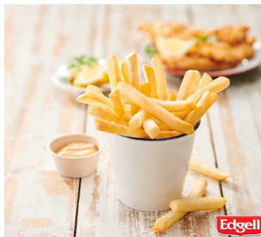
Chips 10mm Ultrafast 4x3.5KG