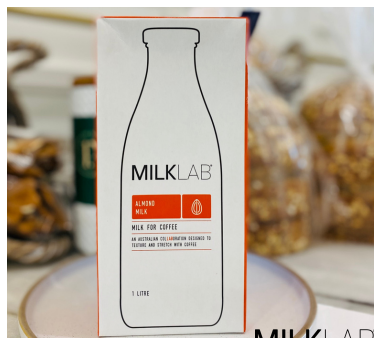
Almond Milk 8x1L